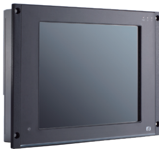
▲ Touch without keypad version