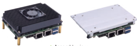
▲ Assembly view