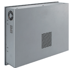
▲ Back view