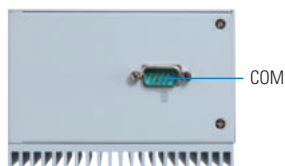
▲ Bottom view