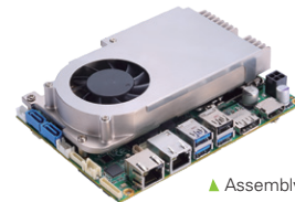
▲ Assembly View

Full-size PCI Express Mini Card slot with mSATA supported