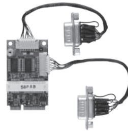
▲ AX92906 with cable