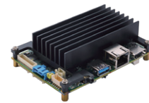
▲ Assembly view for 70°C thermal solution