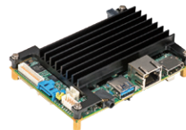
▲ Assembly view for 60°C thermal solution