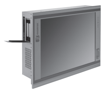
▲ HDD easy maintenance