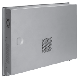
▲ Less screw design