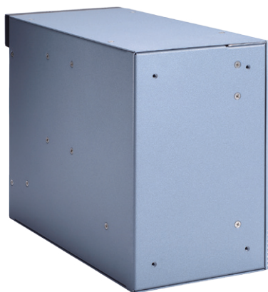
▲ Rear view