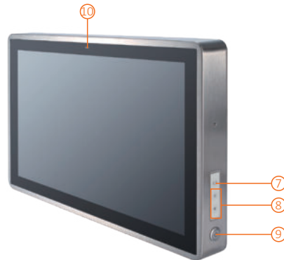
▲ Side view